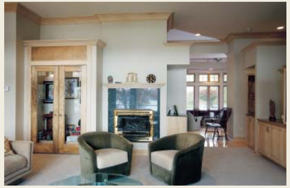
Natural colored trim, built-in curio cabinet, entertainment center, and fireplace make this living room, which is located just off the kitchen, a great place to relax after a gourmet meal.